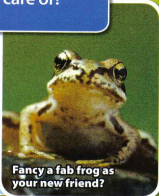
Fancy a fab frog as your new friend?

Keeping a croak is no joke, Bobby! For a start, frogs need to be fed on live bugs, and need a large, clean tank to call home, with light and water provided to keep them healthy and happy. Put some rocks inside the tank and build a hide-hole for your amphibian pet to hop into when it's feeling shy. This should all help to keep your new froggy friend jumping for joy!